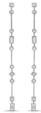
ER197 white gold